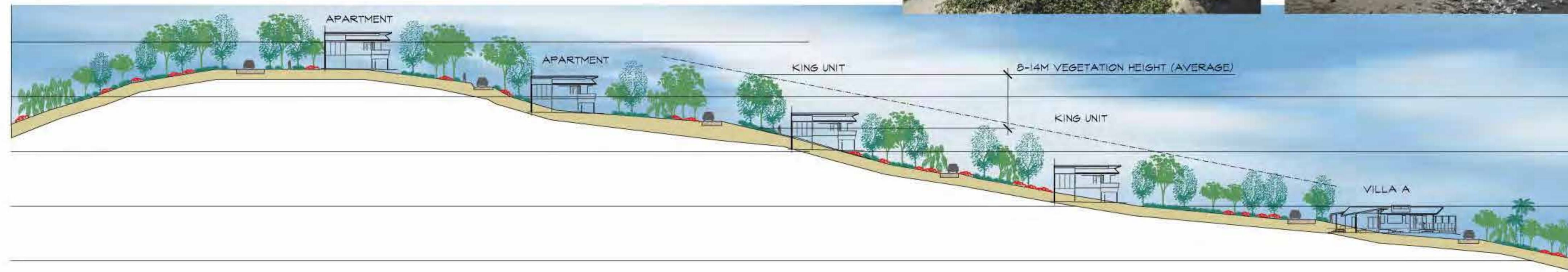
SECTION A 1:500 AT A1

FROM LOWER BEACH POSITION THE HEADLAND GRADES CONCEAL THE MAJORITY OF THE APARTMENTS & ALL OF THE HIGH RIDGELINE COASTAL VILLAS.